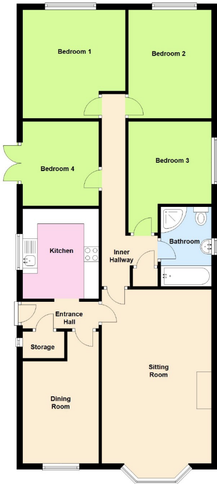
Ground Floor Approx. 97.3 sq. metres Total area: approx. 97.3 sq. metres

This plan is for illustrative purposes only