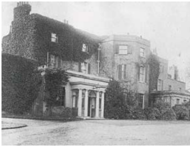
Bush Hill House

Sir Hugh Myddelton a civil, water and mining engineer gained notability for supplying clean water to the City of London with the New River scheme, transforming the health and quality of life of London's citizens.