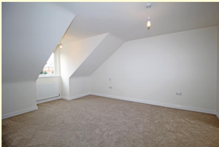
Master Bedroom 14'3" x 12'6" (4.34m x 3.81m)

With two central heating radiators and bathroom.