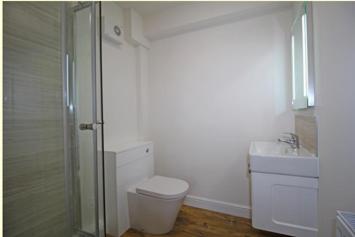
En Suite 5'10" x 5'9" (1.77m x 1.75m)

With corner shower enclosure, Mira advance shower, low flush WC, wash hand basin set on floating vanity unit, extractor fan and central heating radiator.