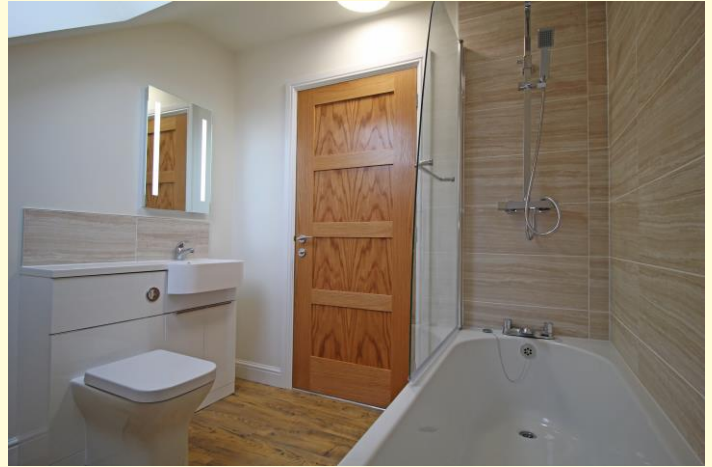
En Suite 8'1" x 7'7" (2.46m x 2.31m)

White suite includes, low flush WC and vanity, sink unit, panelled bath, glazed shower screen fitted mixer shower with twin heads, extractor fan and central heating radiator.