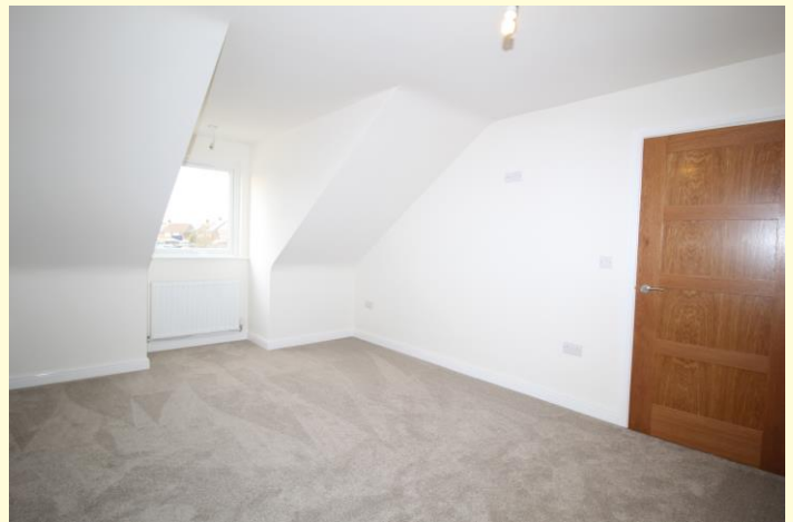
Bedroom Two 15'3" x 11'2" (4.64m x 3.40m)

With two central heating radiators and bathroom.