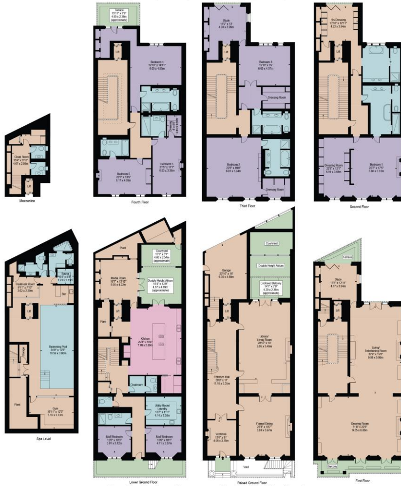
For Illustration Purposes Only - Not To Scale

This floor plan should be used as a general outline for guidance only and does not constitute in whole or in part an offer or contract. Any intending purchaser or lessee should satisfy themselves by inspection, searches, enquiries and full survey as to the correctness of each statement. Any areas, measurements or distances quoted are approximate and should not be used to value a property or be the basis of any sale or let.