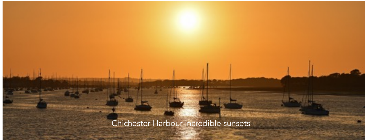
Chichester Harbour incredible sunsets

A superbly presented, well appointed detached house with particularly spacious accommodation, ideal for a family or potential to generate additional income and well located opposite open countryside yet only about 250 yards from the harbour. Beautifully landscaped secluded gardens and grounds with a westerly rear aspect, in all, set in about 0.23 acres.