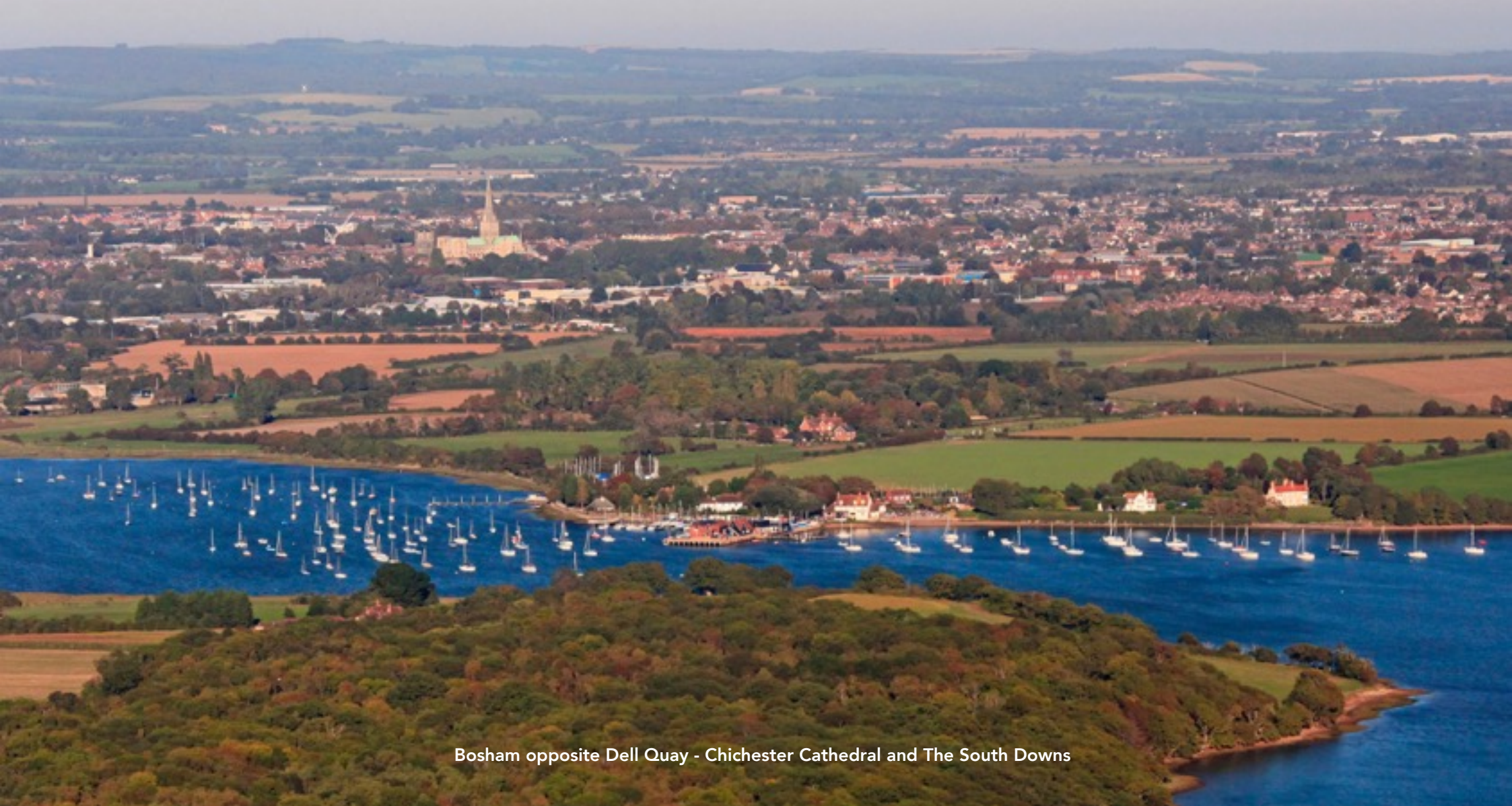
Bosham opposite Dell Quay - Chichester Cathedral and The South Downs