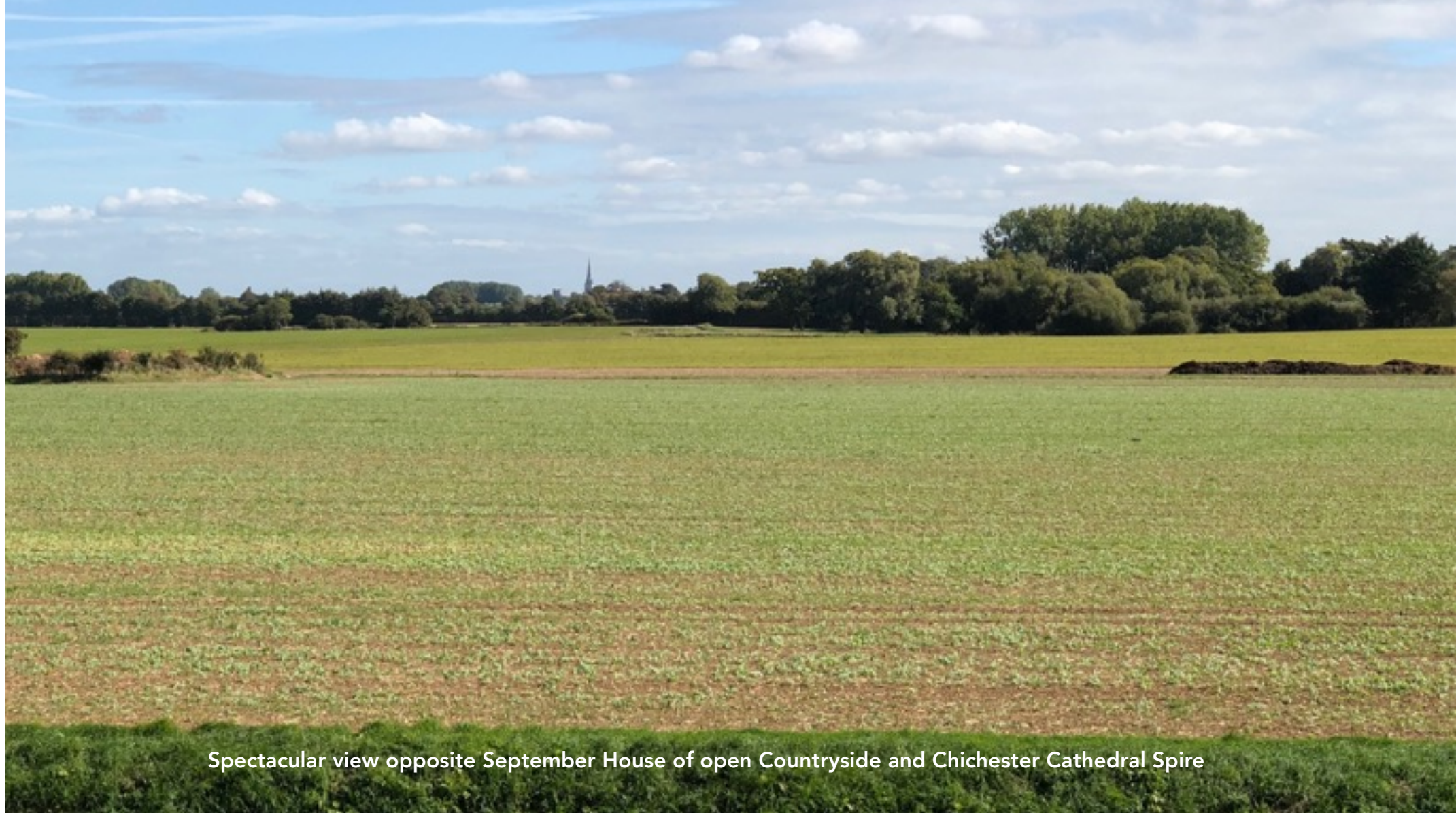
Spectacular view opposite September House of open Countryside and Chichester Cathedral Spire