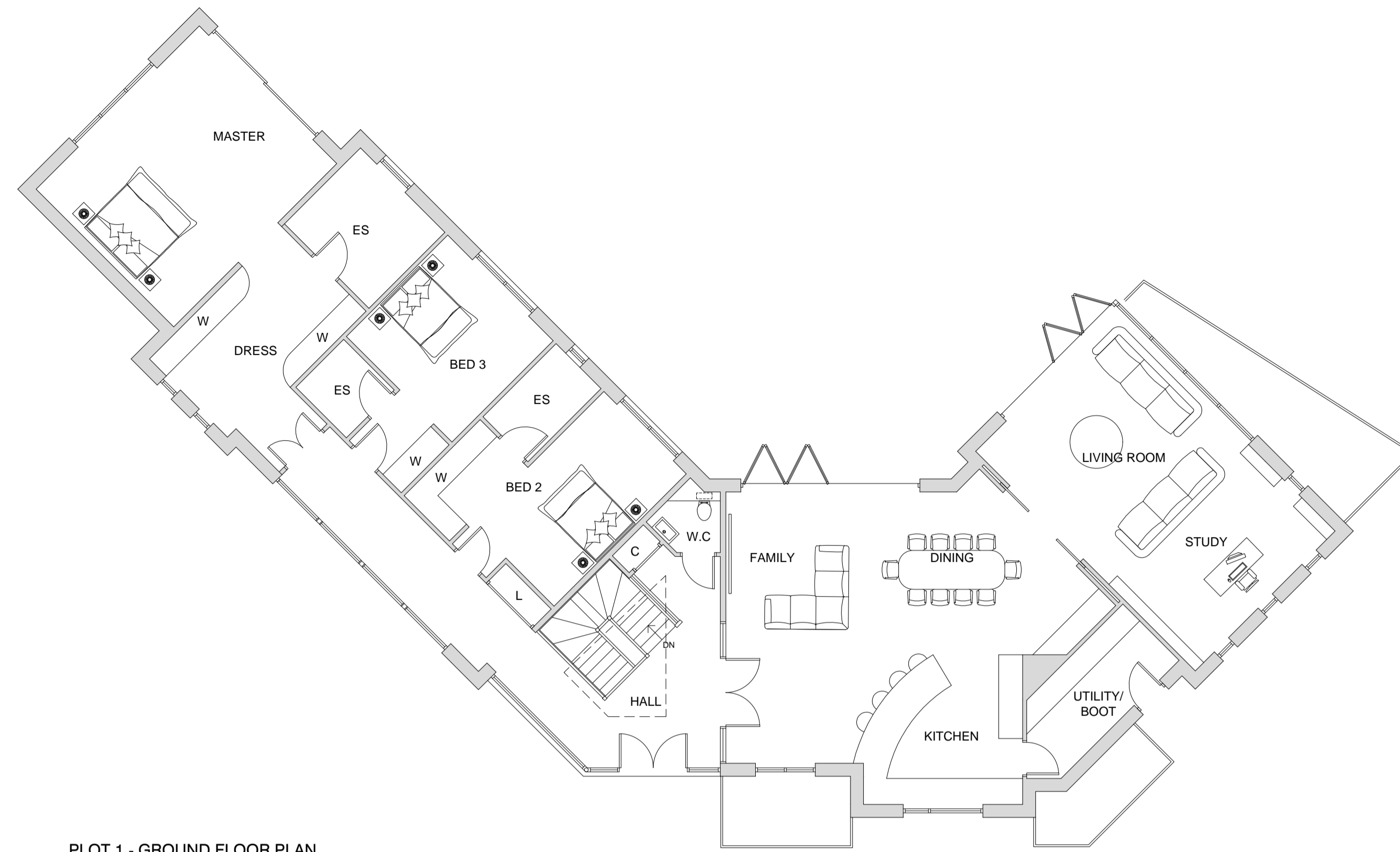
PLOT 1 - GROUND FLOOR PLAN G.I.A. - 253 m 2 - (2723 ft 2 )