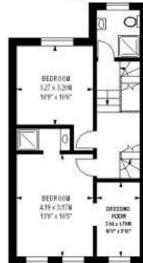
First Floor 563 sq ft

Fletchers Chiswick High Road Lettings 86 Chiswick High Road, Chiswick, London, W4 1SY 020 8742 4100 chiswicklettings@fletcherestates.com