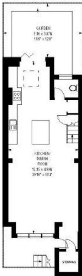
Lower Ground Floor 658 sq ft