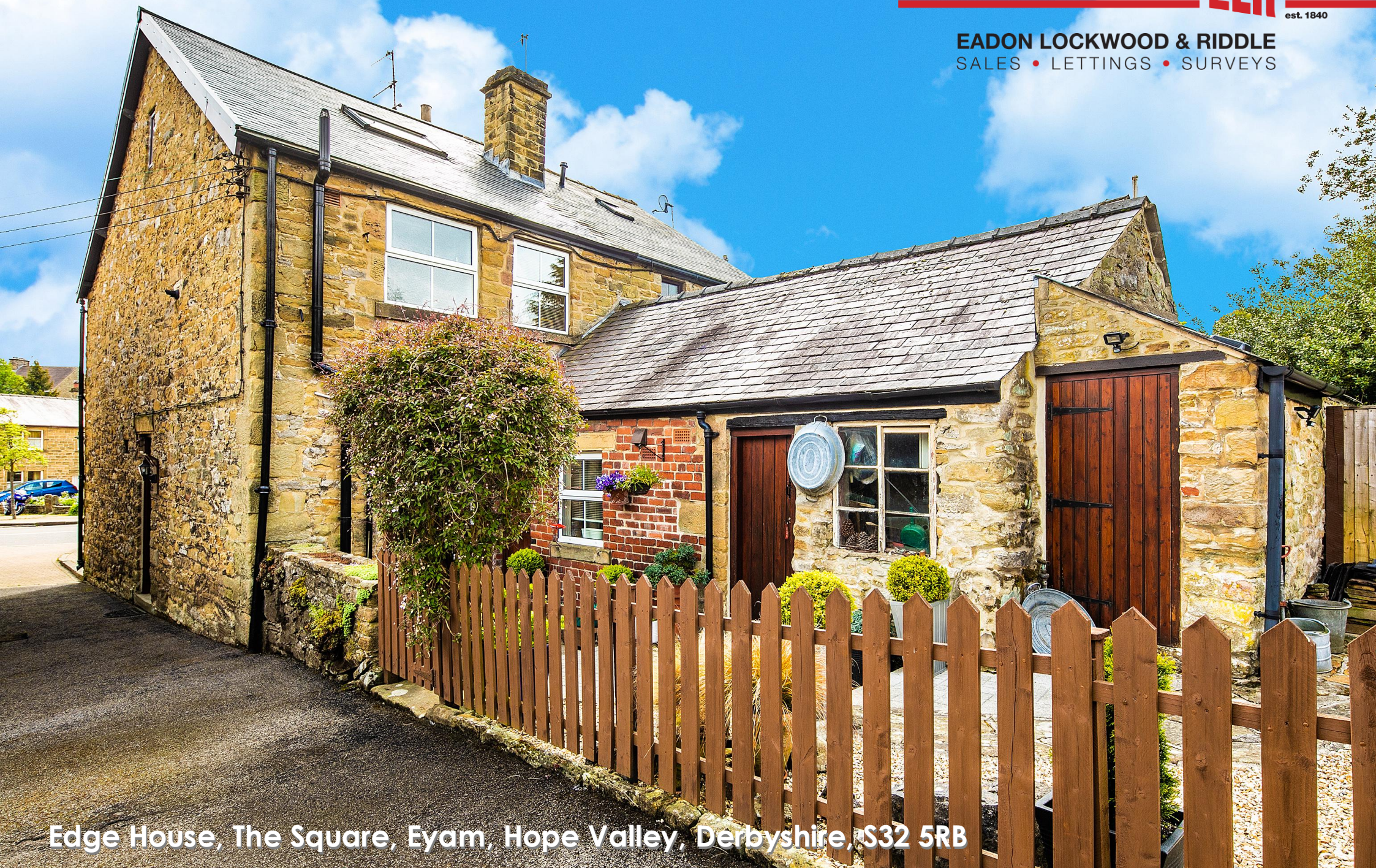
Edge House, The Square, Eyam, Hope Valley, Derbyshire, S32 5RB

EADON LOCKWOOD & RIDDLE SALES • LETTINGS • SURVEYS