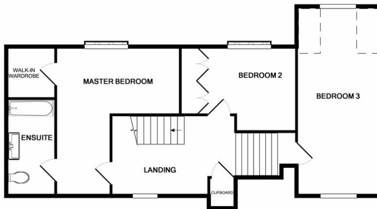
1ST FLOOR APPROX. FLOOR AREA 803 SQ.FT. (74.6 SQ.M.)

TOTAL APPROX. FLOOR AREA 1572 SQ.FT. (146.0 SQ.M.)