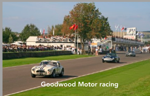
Goodwood Motor racing