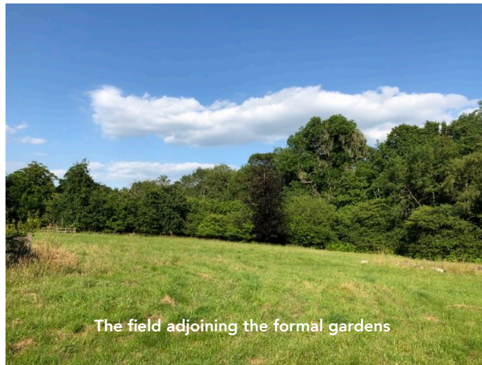
The field adjoining the formal gardens