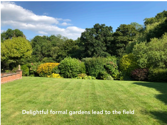
Delightful formal gardens lead to the field