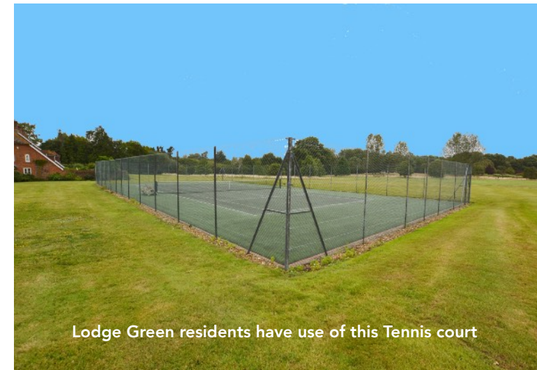
Lodge Green residents have use of this Tennis court