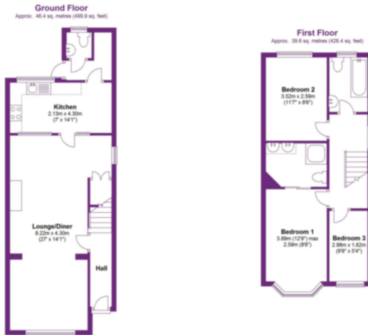
Total area: approx. 86.1 sq. metres (926.3 sq. feet) This floor plan is not to scale. They are for guidance only and accuracy is not guaranteed. Plan produced by Vibrant Energy Matters. Plan produced using The Mobile Agent.