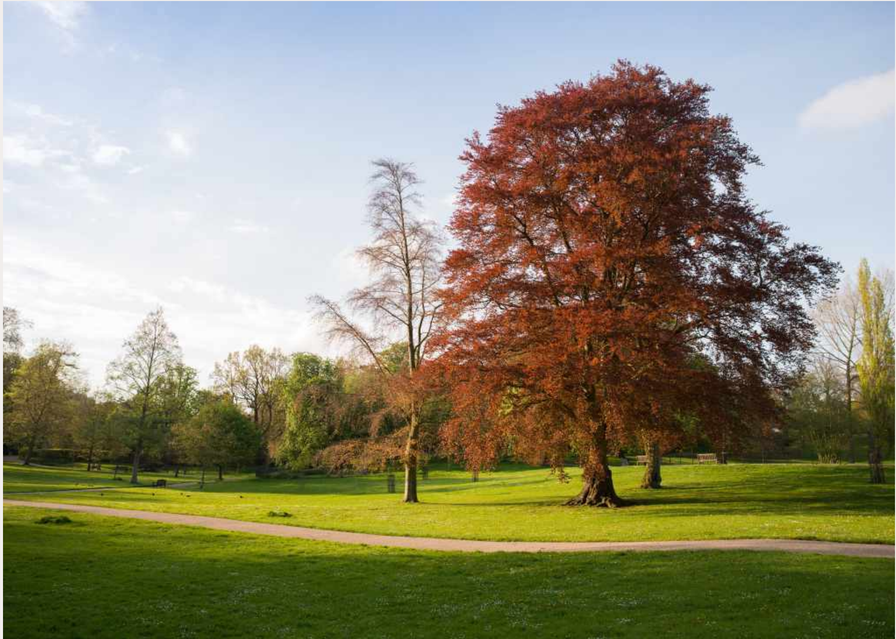
Image of Christchurch Park, Ipswich