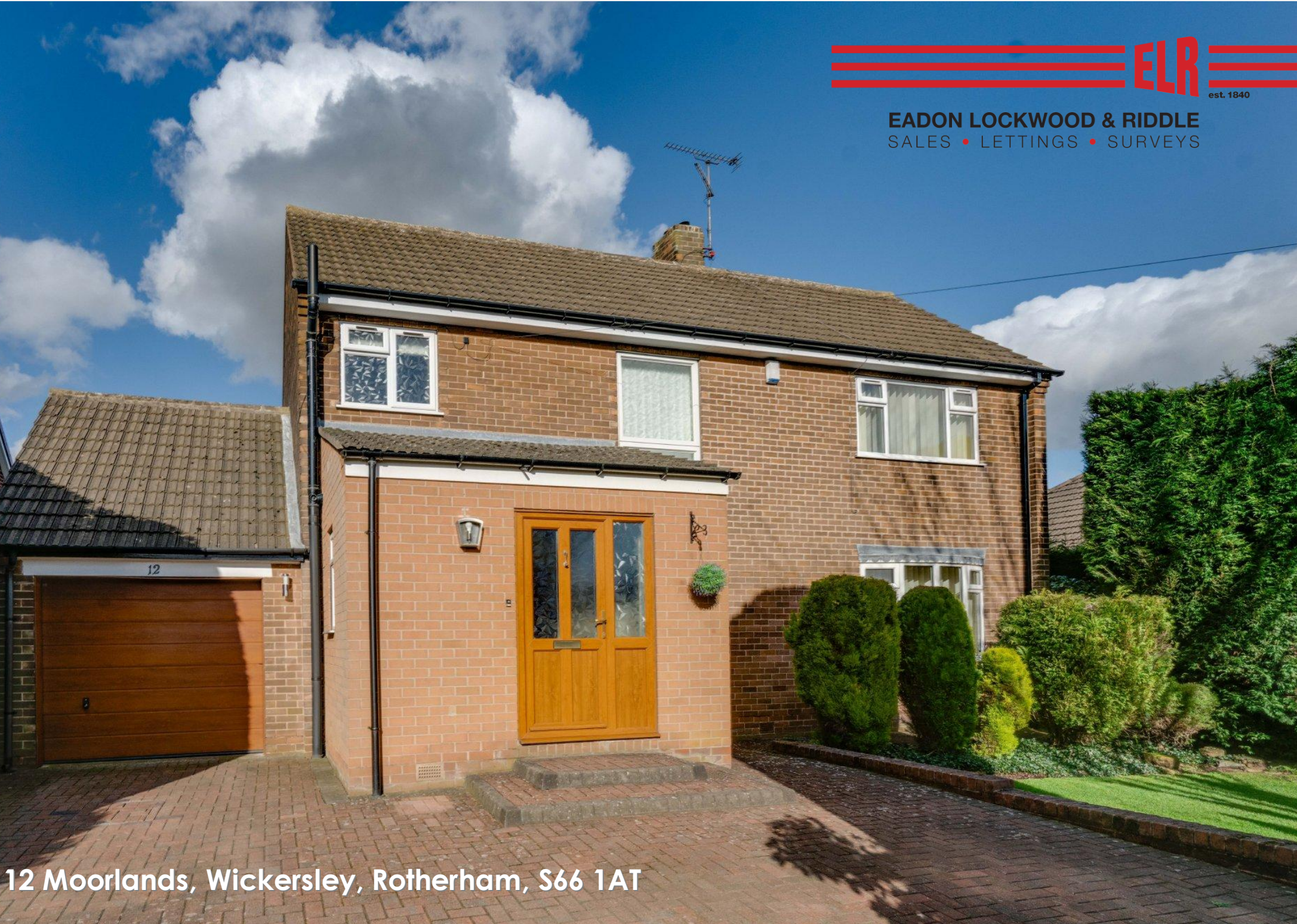
12 Moorlands, Wickersley, Rotherham, S66 1AT