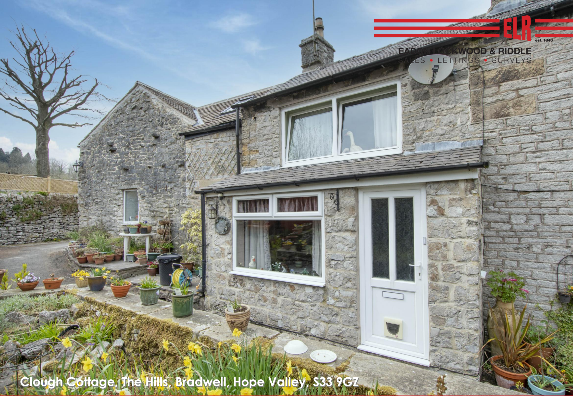
Clough Cottage, The Hills, Bradwell, Hope Valley, S33 9GZ