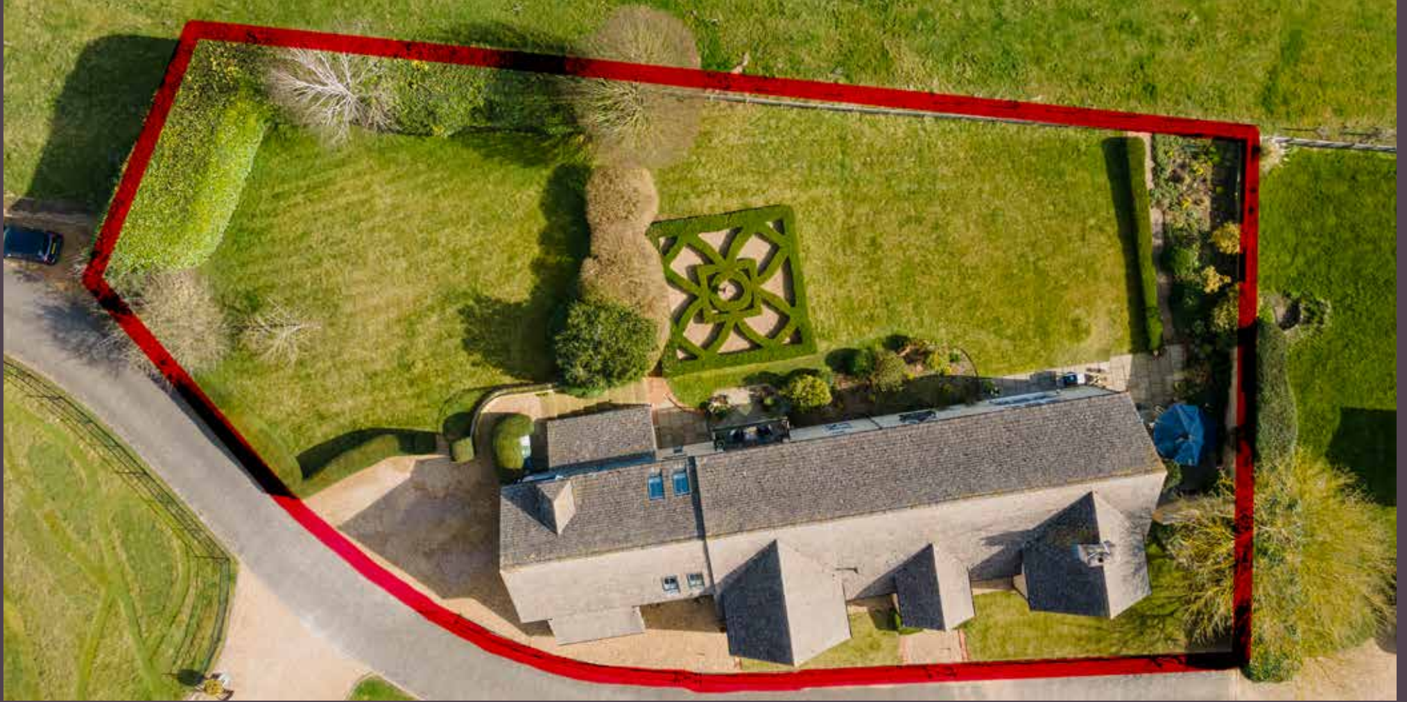
North Brook House, Lower Farm Close, Empingham LE15 8RB