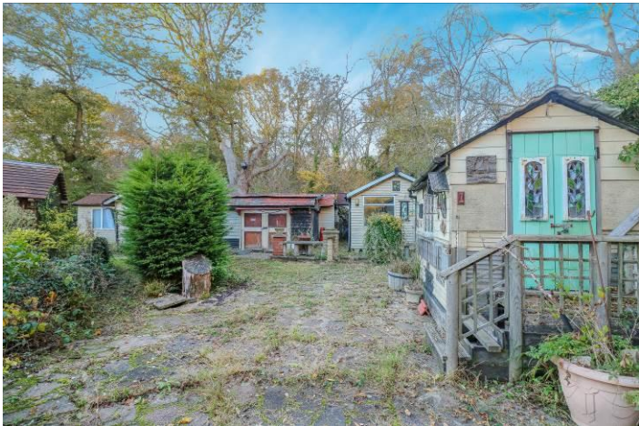
The driveway and property is accessed via double opening wrought iron gates.