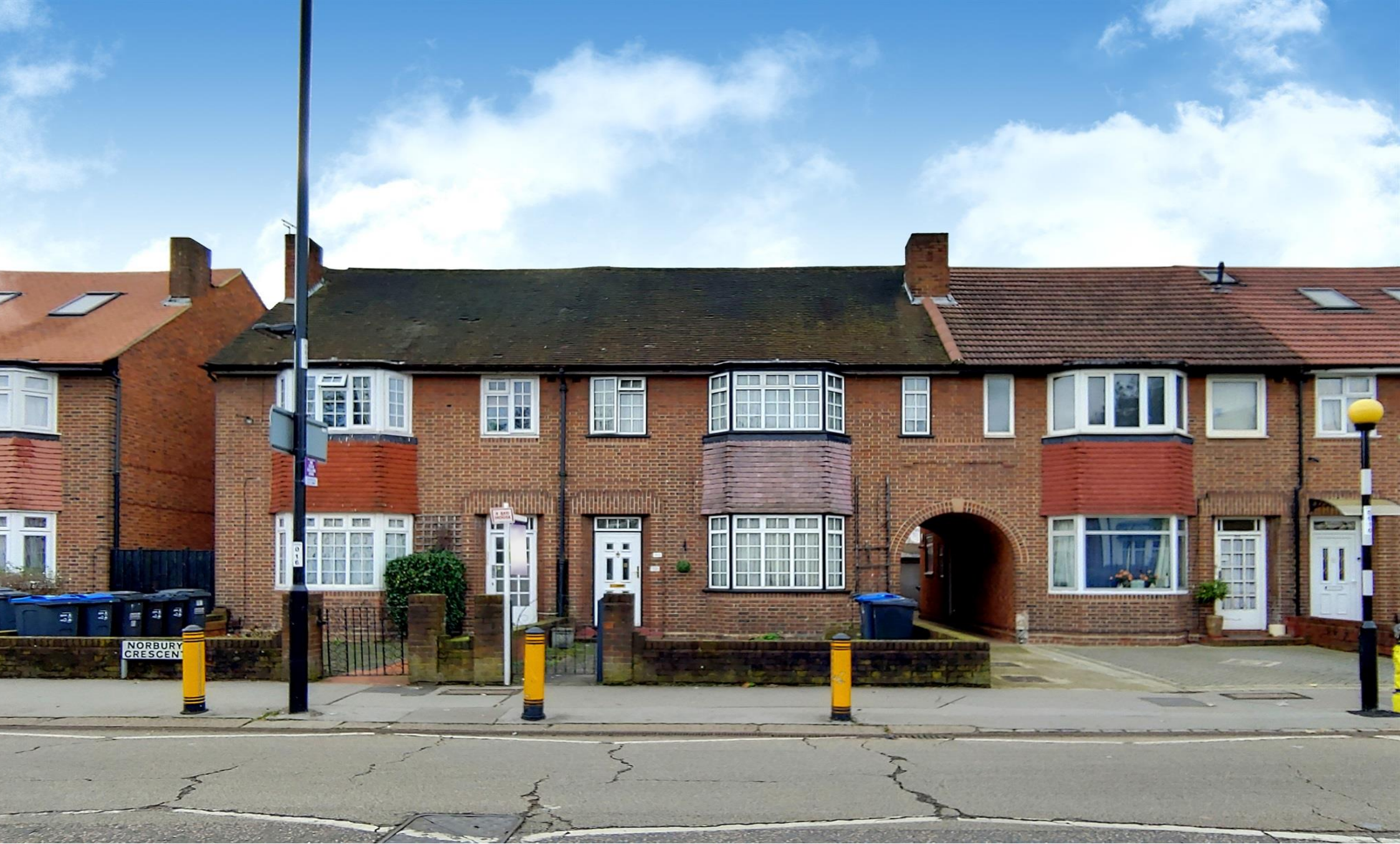
Norbury Crescent, Norbury, SW16 4LA