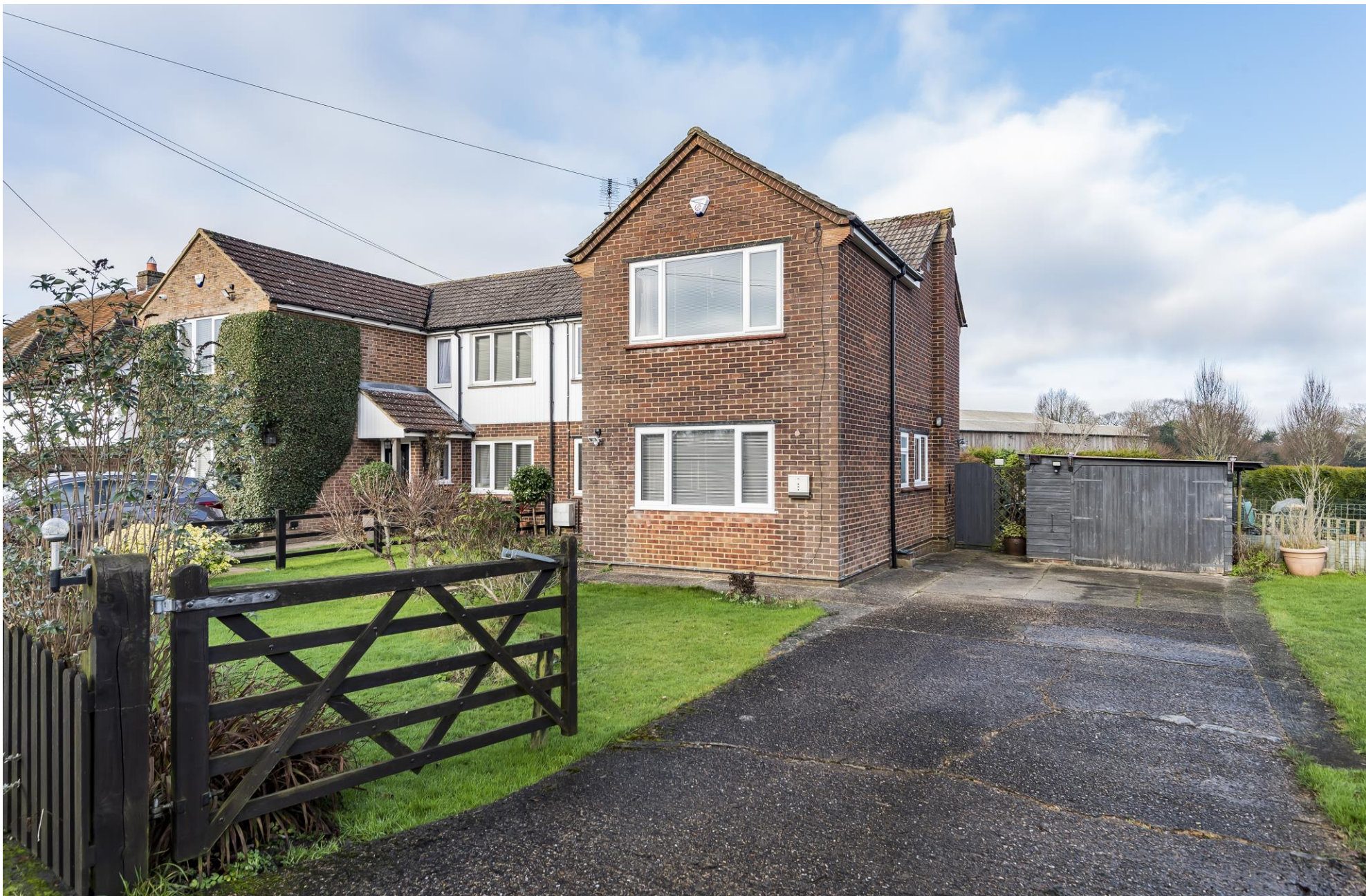
Flamstead Way Chesham Road, Ashley Green Chesham HP5 3PH