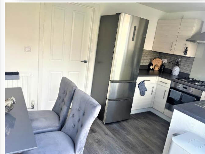
Lactans Edge, Leighton Buzzard, LU7 9SY