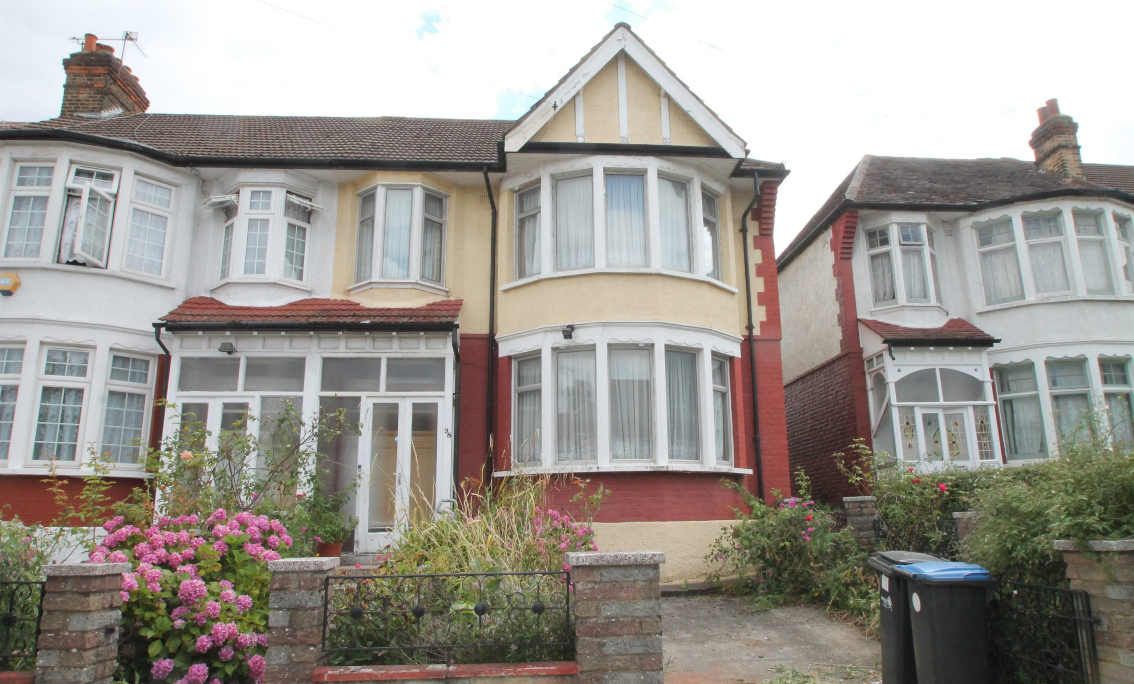
Grenoble Gardens, Palmers Green, London, N13 £650,000 Freehold