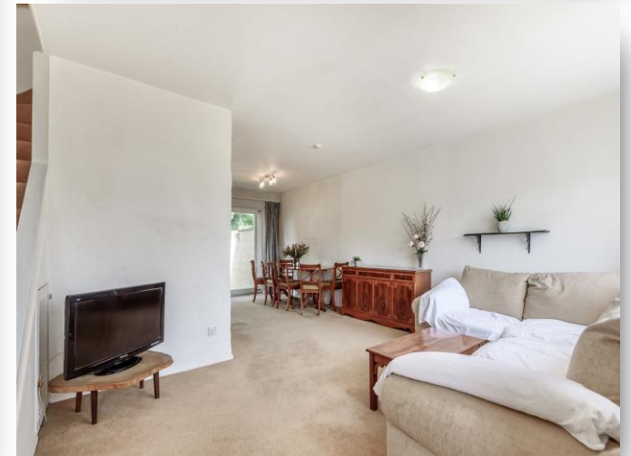
5 Welbeck Road, Maidenhead SL6 4EB