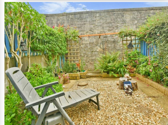
Washbourne Close, Plymouth PL1 4ST