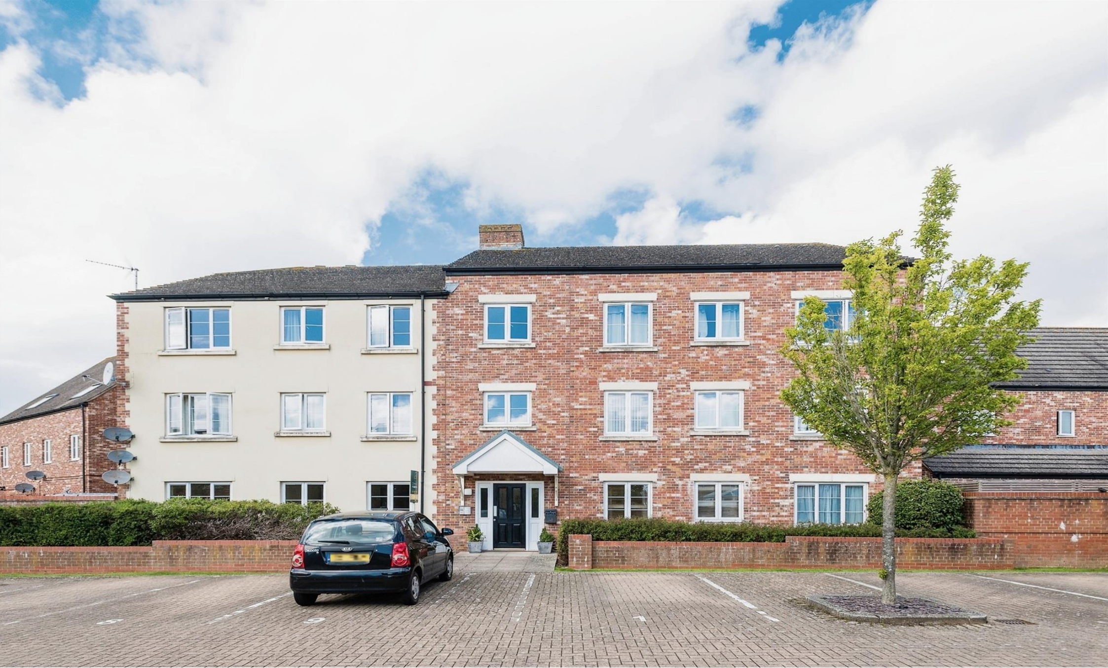
Jason House Poseidon Close, Swindon SN25 2LY