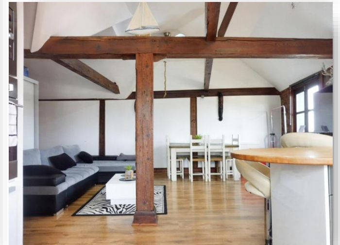
Schooner Wharf, Old Market, Wisbech PE13 1NJ