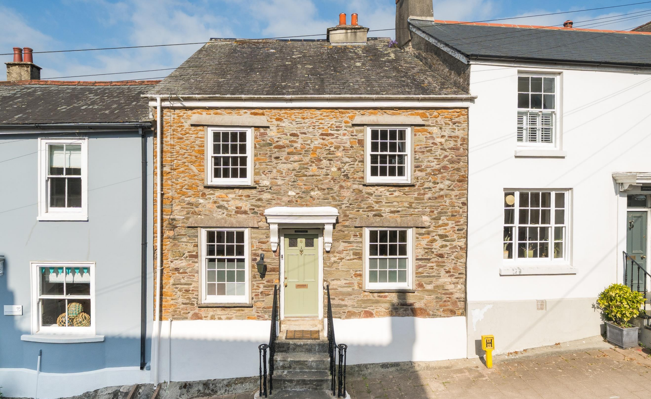
Pickle House, 16 Brownston Street Modbury, Ivybridge, PL21 0RG