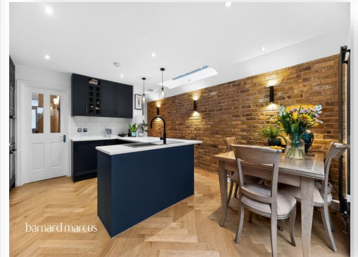
Ingelow Road, London SW8 3PE