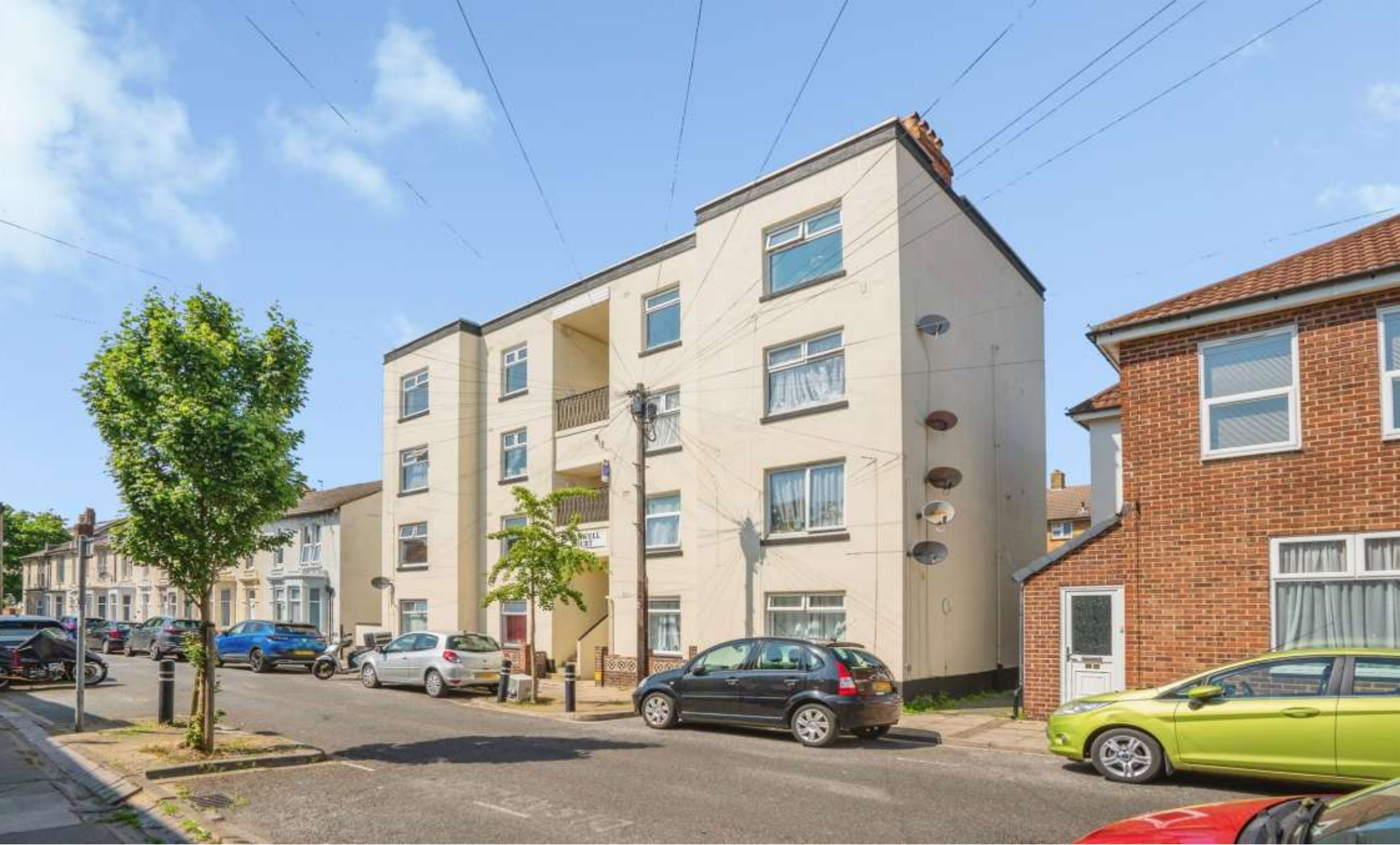
Shadwell Court Winstanley Road, Portsmouth PO2 8JU