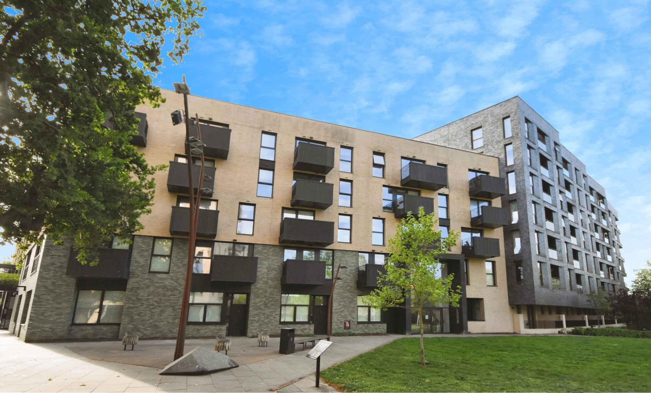
Eccles Court Burgess Springs, CHELMSFORD CM1 1JB