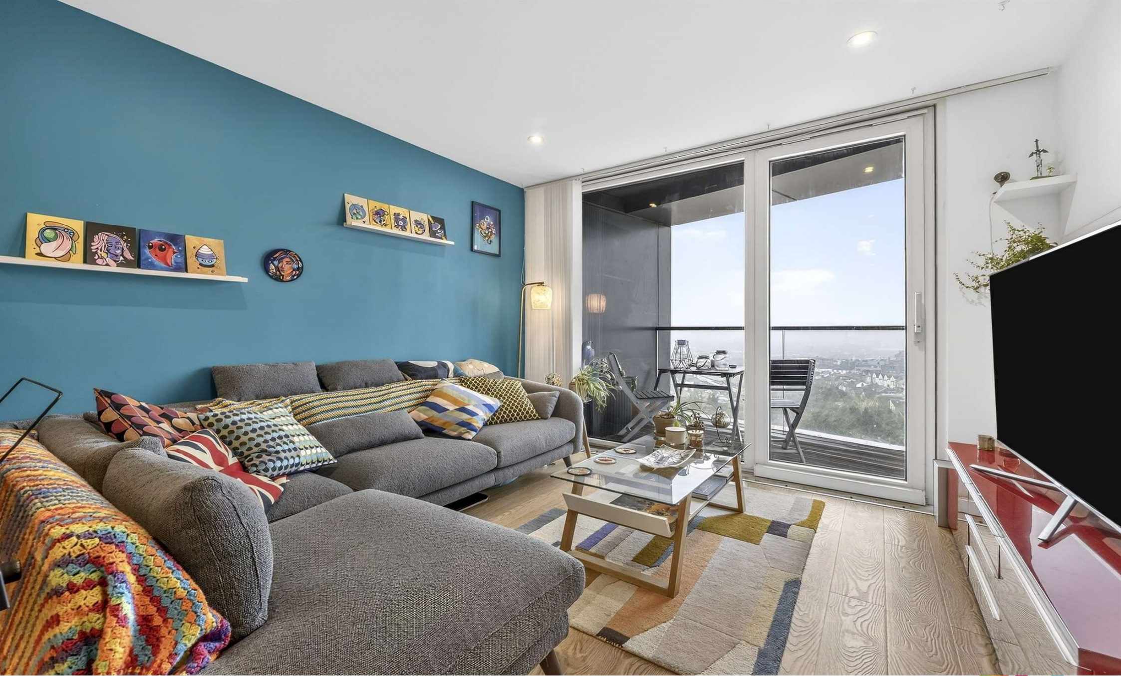
Newgate Tower Newgate, Croydon CR0 2FD