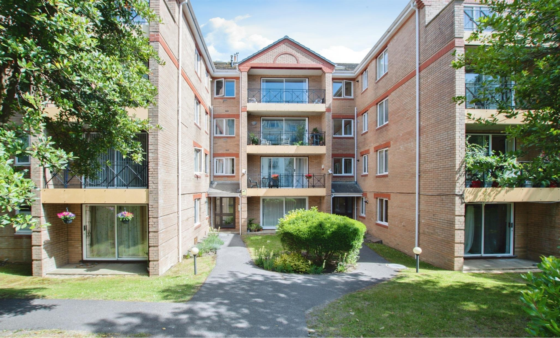
Alexandra Lodge Parsonage Road, Bournemouth BH1 2HL