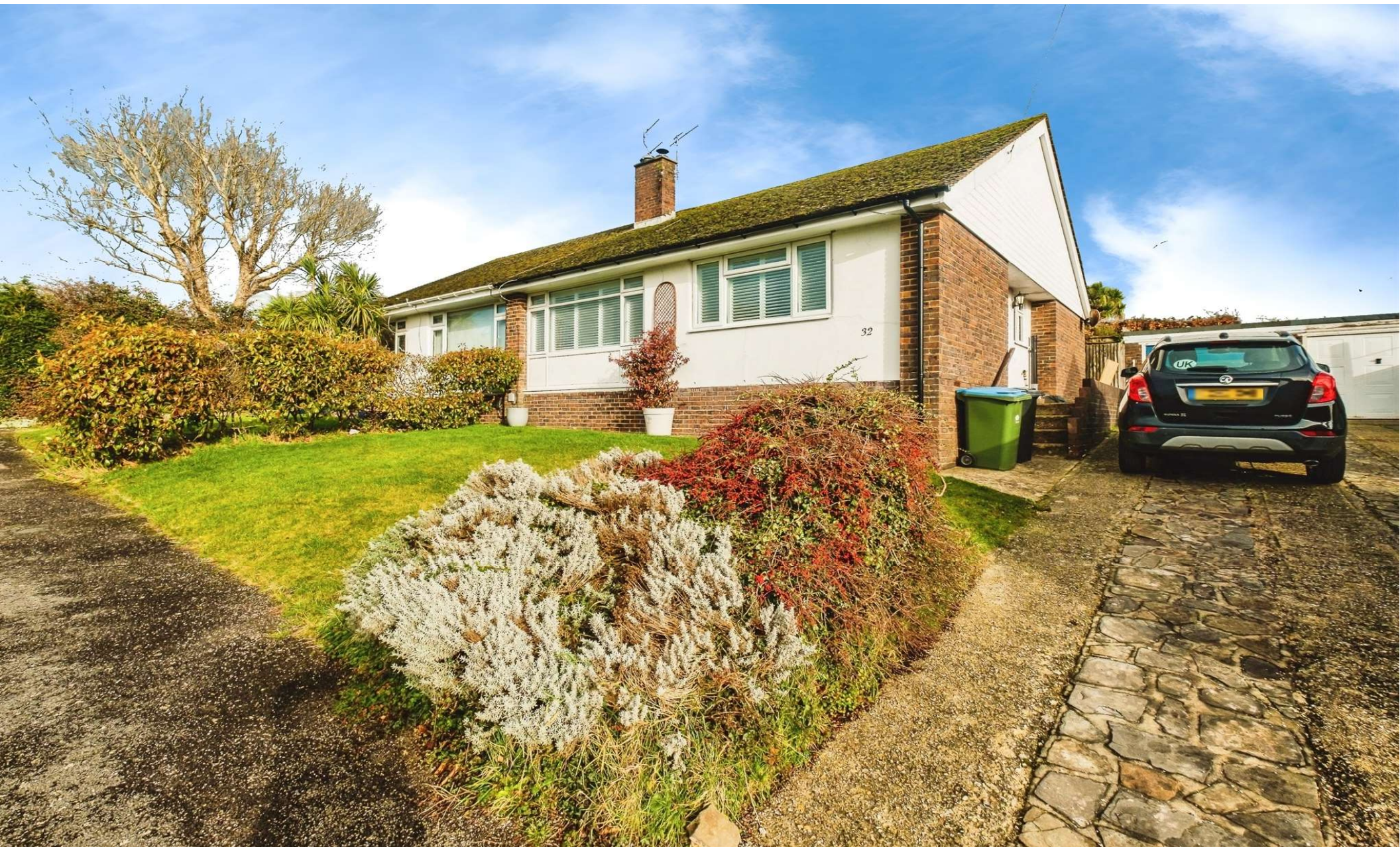
Beech Road, Findon Worthing BN14 0UR