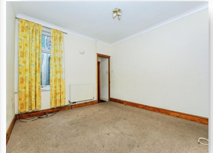
Clarence Road, Wisbech, PE13 2ED