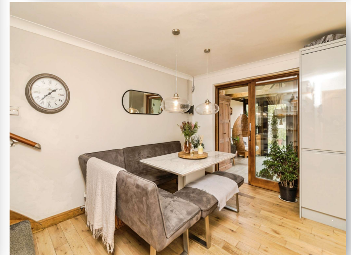
Century On Green Lane, Kessingland Lowestoft NR33 7RH