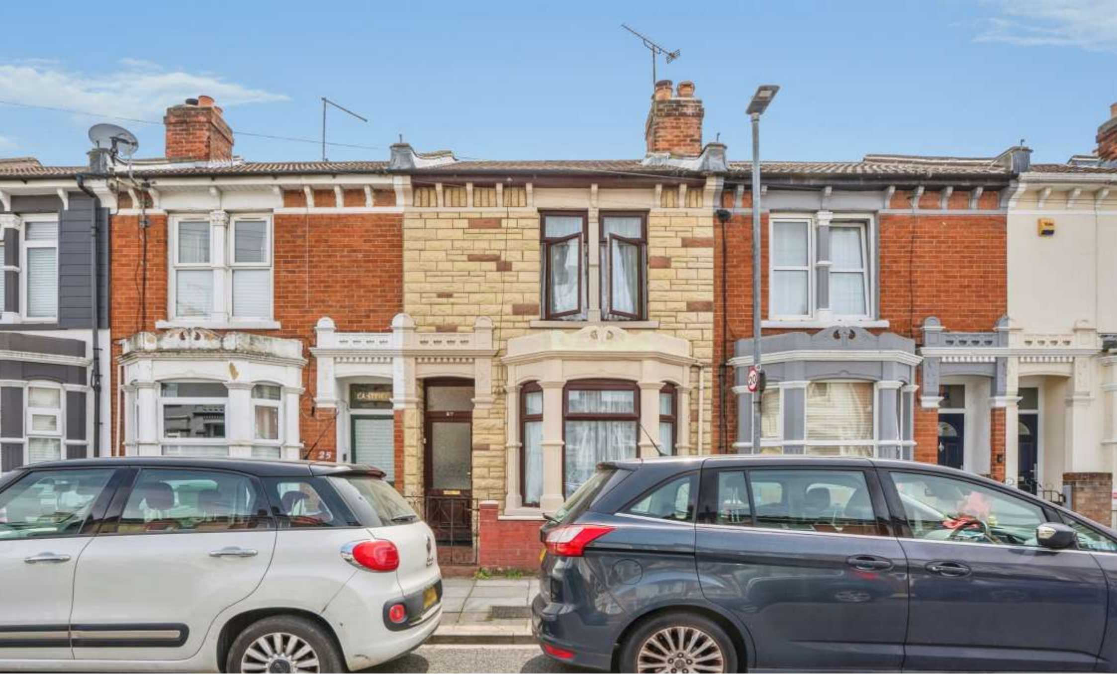
Wallington Road, Portsmouth PO2 0HB