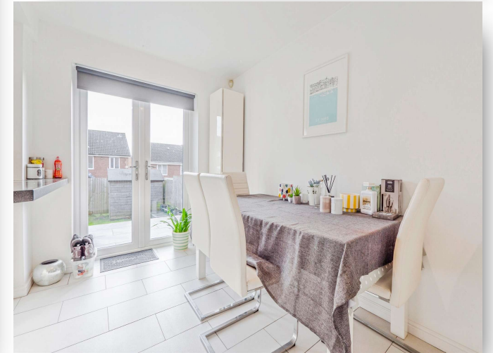
Clos Nant Mwan, Pontprennau Cardiff CF23 8NA