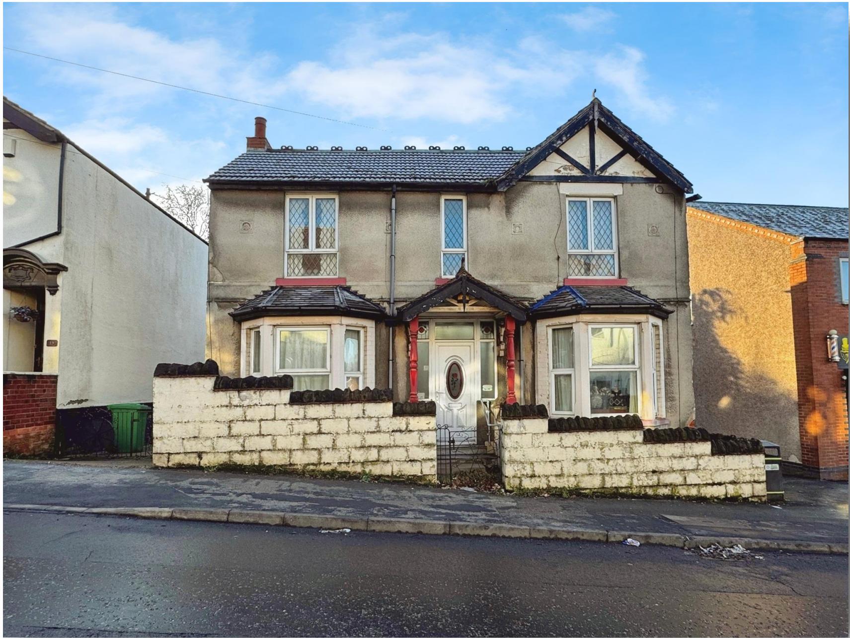
St. Bartholomews Road, Nottingham NG3 3EG