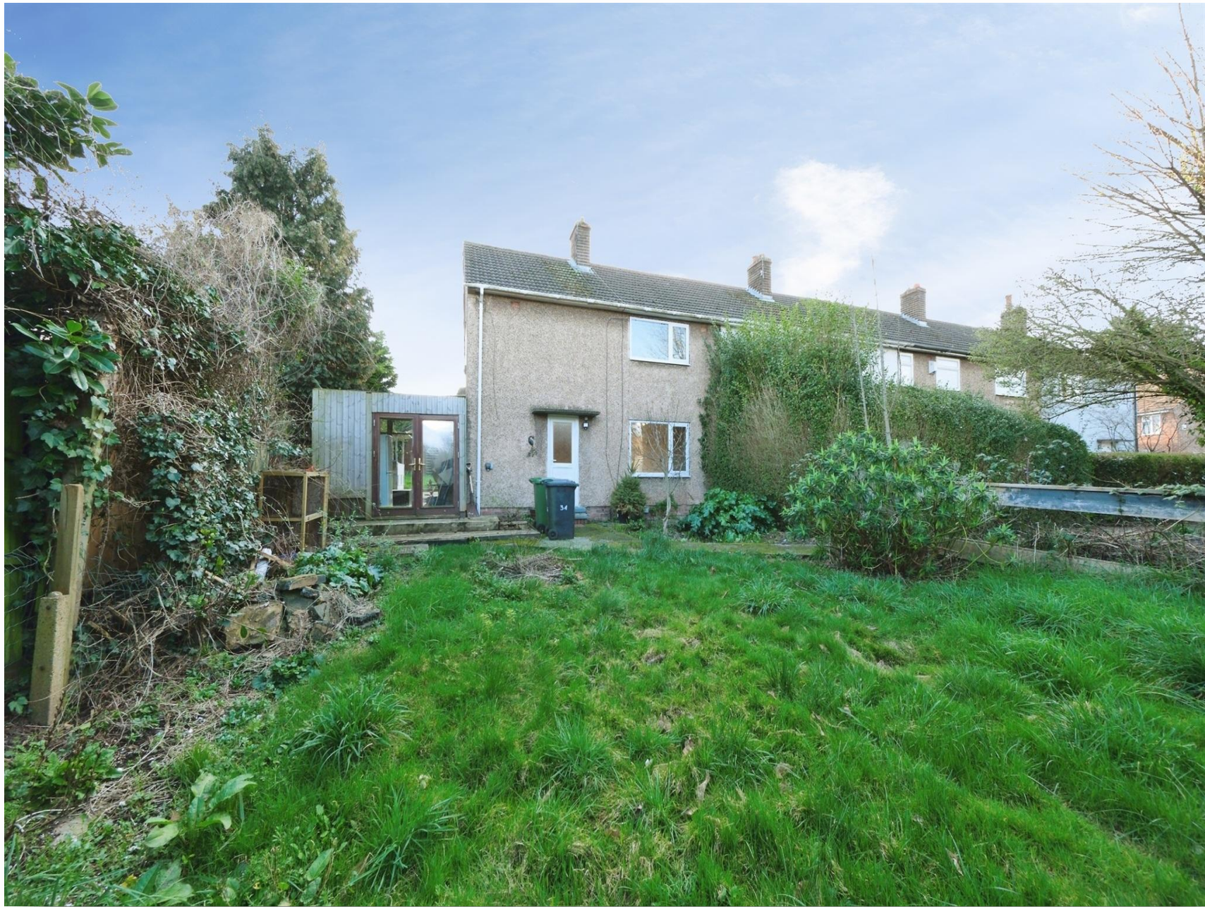
Lymn Avenue, Gedling Nottingham NG4 4EA