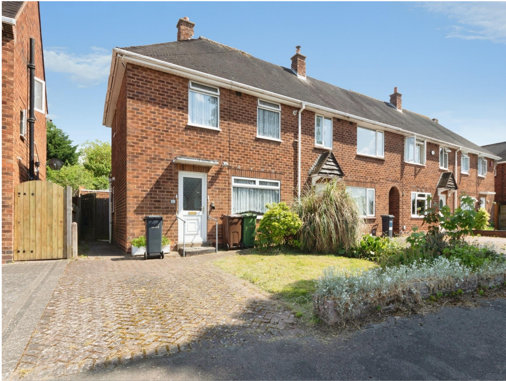
Scott Road, Solihull B92 7LW