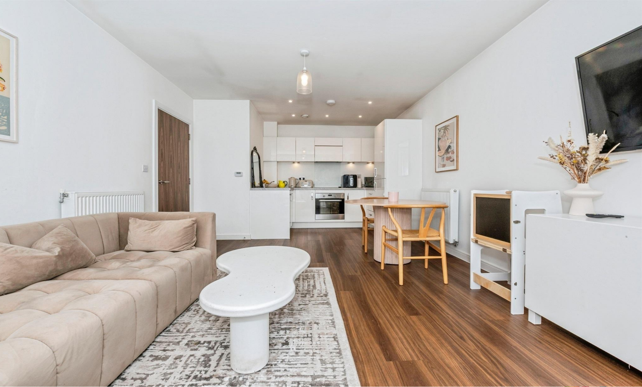
Dovestone Close, West Thurrock Grays RM20 3DF