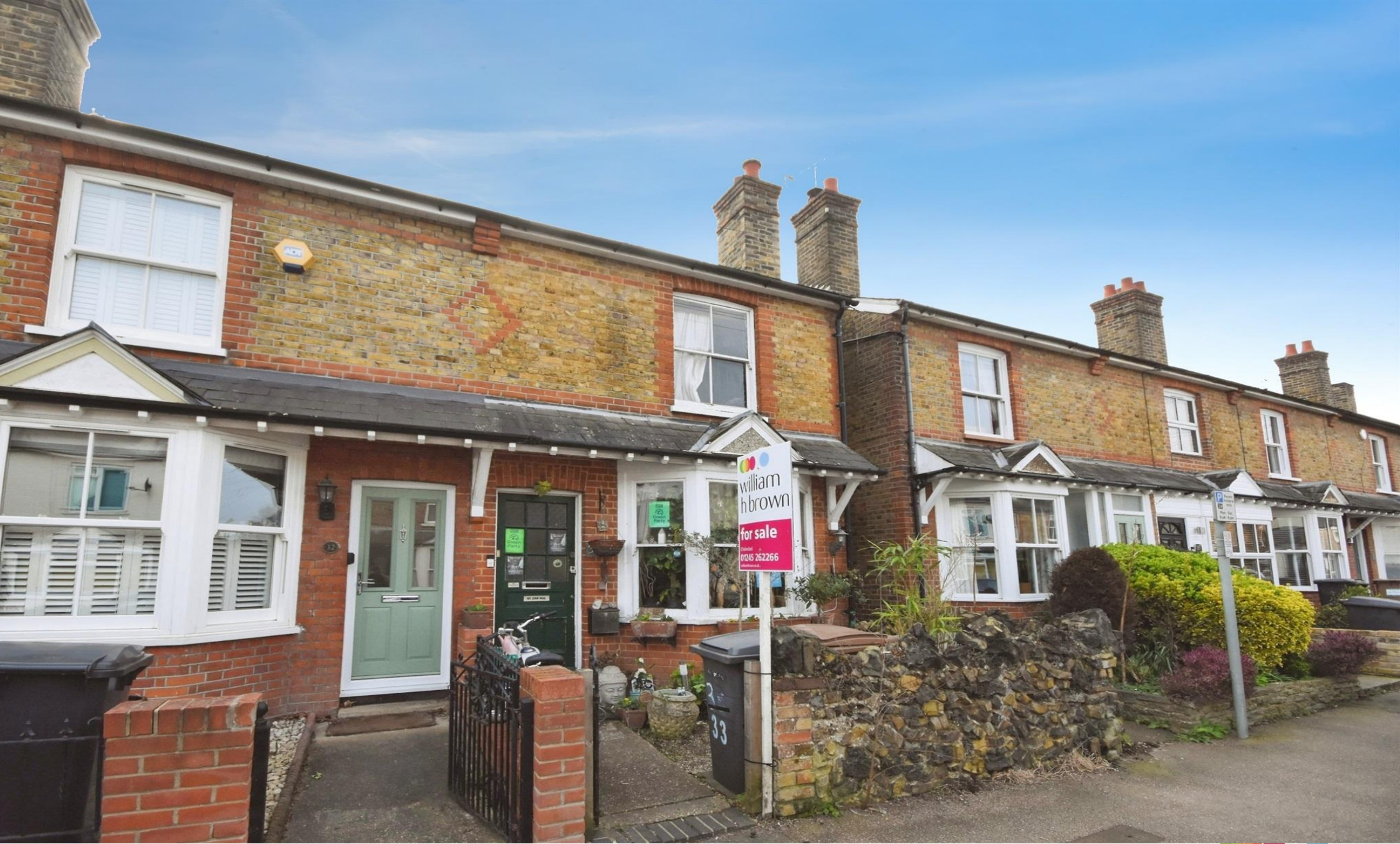
Nursery Road, Chelmsford CM2 9PL