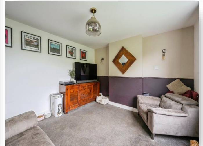
Cadeby Avenue, Conisbrough Doncaster DN12 3LE