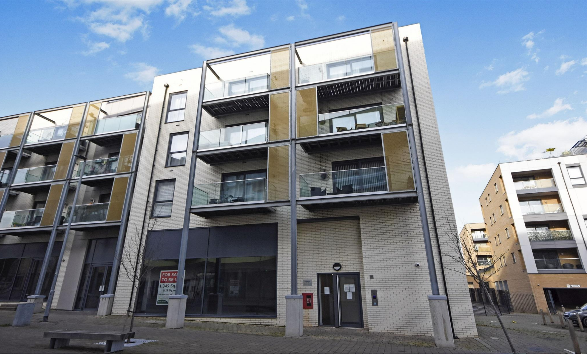
Cunard Square, Chelmsford CM1 1AQ