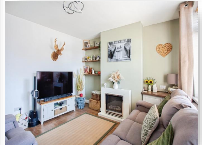
Goldthorpe Road, Goldthorpe Rotherham S63 9EN