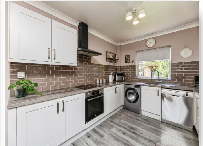
Leigh Avenue, Tingley Wakefield WF3 1PB