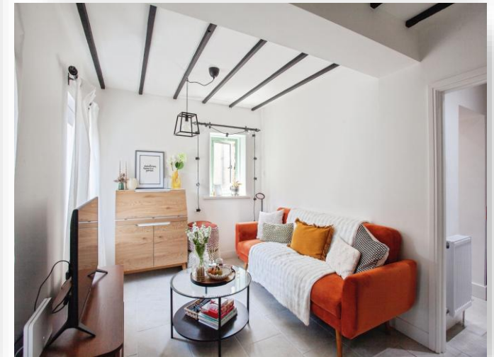
Sandygate, Wath-Upon-Dearne Rotherham S63 7LW