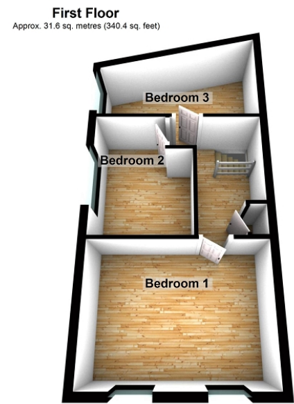
First Floor Approx. 31.6 sq. metres (340.4 sq. feet)