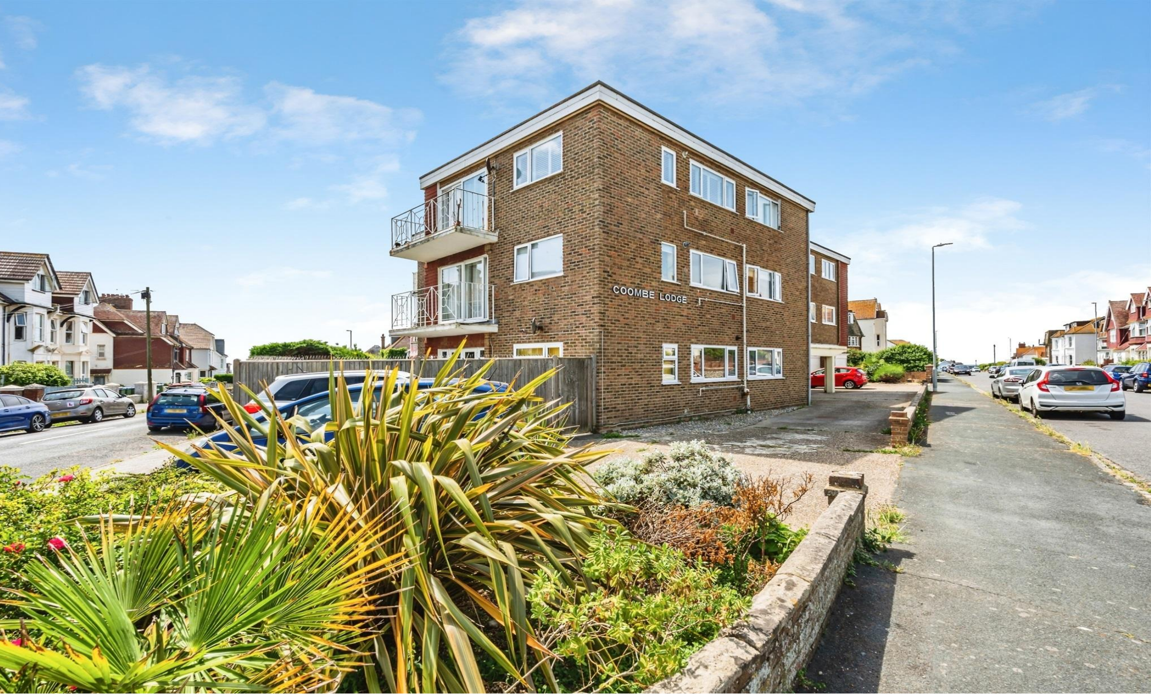
Coombe Lodge Claremont Road, Seaford BN25 2QD