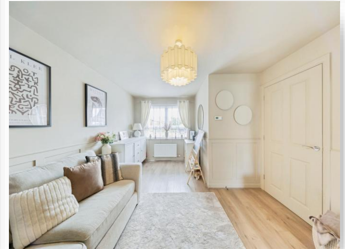
Sabina Close, Fairfields Milton Keynes MK11 4DJ