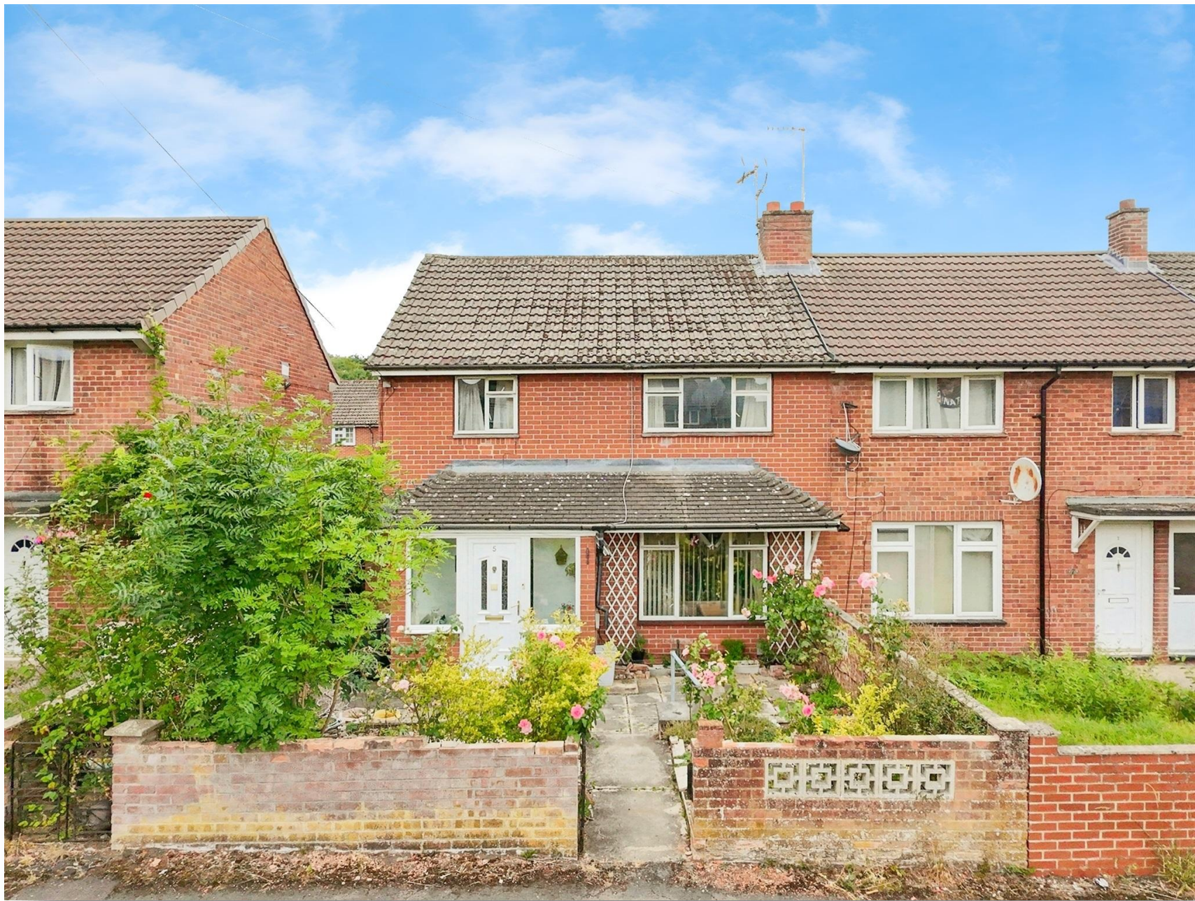
Imber Walk, Swindon SN2 5NZ