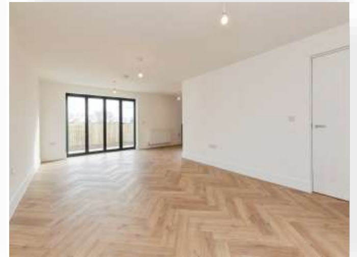
Maple Close, Thornley Durham DH6 3DW